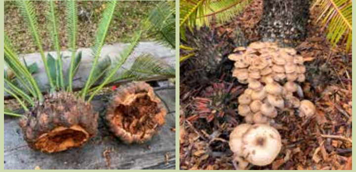
LEFT: Armillaria at the base of a Dioon edule . This plant did not survive. RIGHT: Stems of Dioon califanoi and D. sonorensis excised of infected rotten tissue. Now being re-rooted.

We are currently working to raise funds for an emergency renovation of this portion of the Garden in which we will use the same methods of a successful Armillaria remediation two decades ago in a different part of the Cycad Garden. The project entails hiring a contractor to excavate the site and remove roots, stumps and infected soil. Lotusland staff will direct the excavation and the removal of additional plants. The contractor will install drainage throughout much of the garden. A custom soil mix and amendments determined by Lotusland staff will be brought in and plants will be re-planted, irrigation installed and the area mulched. We have additional plants of Dioon in the nursery from a collecting expedition in 2004 and this will afford us the opportunity to plant and display these special plants. —Paul Mills, Curator of the Living Collections