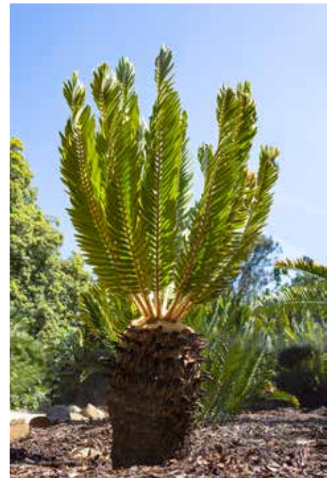
TOP: Encephalartos latifrons x altensteinii ABOVE: Encephalartos heenanii

As cycads and plants in general become more threatened botanic gardens and their conservation networks are more relevant than ever as they become increasingly interconnected and function as collaborative units that work across borders. Much as zoos do with animals, botanic gardens are important life rafts for threatened species ensuring they don't go extinct, working to reverse the trend through captive breeding programs. Cycads are considered the