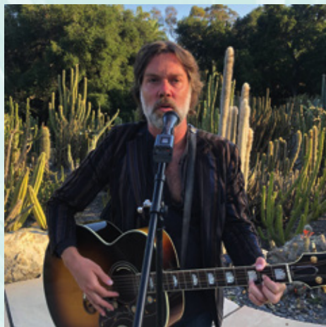
Rufus Wainwright performs in Lotusland's Cactus Garden for the Lotusland Celebrates gala pre-recorded event video.