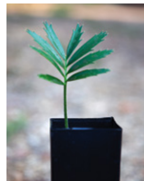
Encephalartos trispinosus x woodii