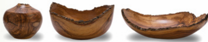
FROM LEFT: 4 1/2" tall by 5" wide $95.00 5" tall by 9" wide $150.00 4" tall by 12" wide $165.00

Beautifully turned wood bowls made from Lotusland's olive trees by artist Don Scott are available in Lotusland's Garden Shop and online at lotuslandshop.org . Members save 10% on all purchases. www.lotuslandshop.org .