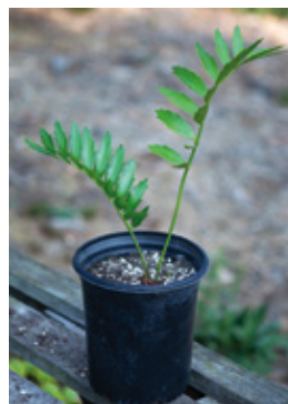
Encephalartos horridus x woodii

Bidding opens on Tuesday, October 6 at 10:00 AM and ends on Saturday, October 17 at 3:30 PM. Be sure to bid early - go to www.lotusland.org/plantauction .