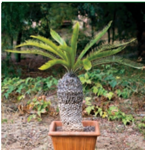
This very rare cycad, a Dioon californoi , will be available to the highest bidder.