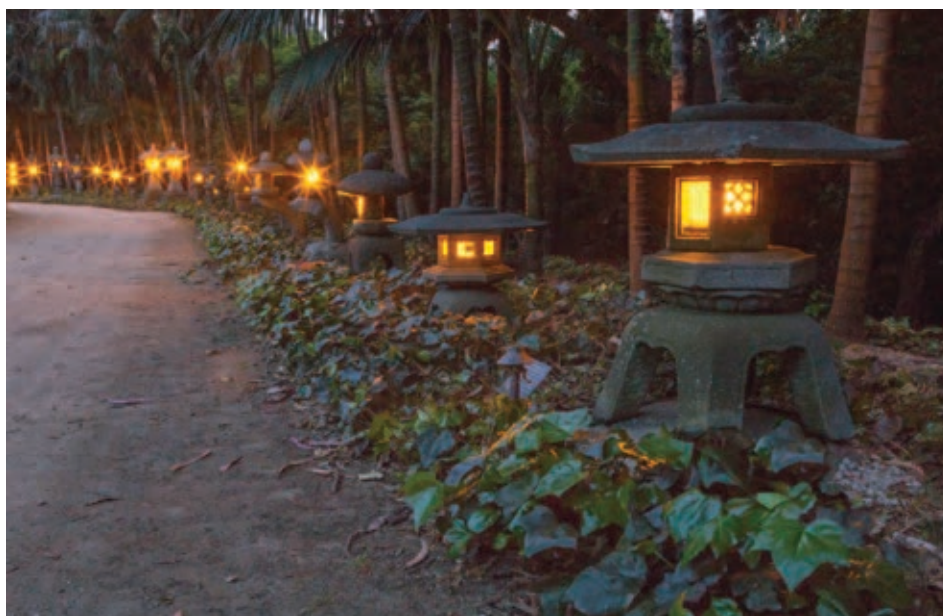
The Ishi-Dōrō exhibit lit up for evening festivities.