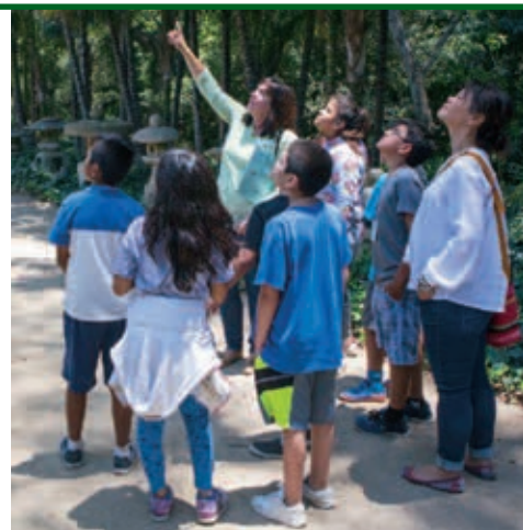
Students from the Fun in the Sun program, sponsored by the United Way, visited Lotusland this summer.

This summer, Lotusland provided the incoming 4th through 6th grade students participating in the Fun in the Sun program at La Patera School with the opportunity to learn about life science, photosynthesis and botany in the classroom and here in Lotusland's garden. For the incoming 4th grade students, it provided a first look at what they will learn when they start their 2017/2018 academic school year in August. The 5th and 6th grade students had the opportunity to review what