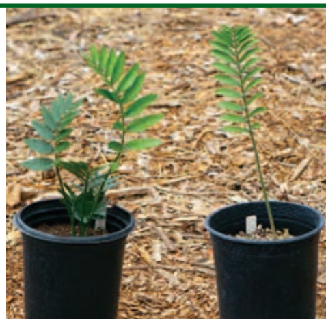
These rare cycad specimens from Lotusland's nursery are Encephalartos latifrons X woodii (LEFT) and Encephalartos heenanii (RIGHT).