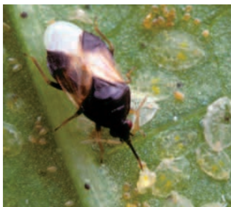
Pirate bug ( Orius ) feeding on whitefly nymphs.