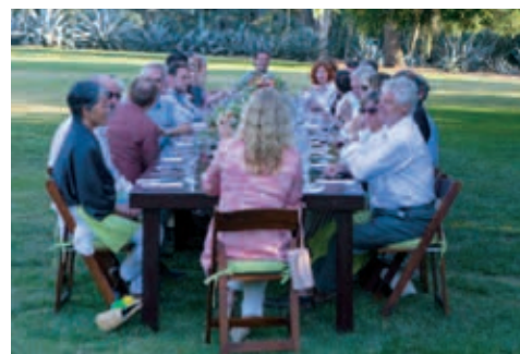
Garden Lover members receive invitations to our intimate farm-to-table dinners in the garden.