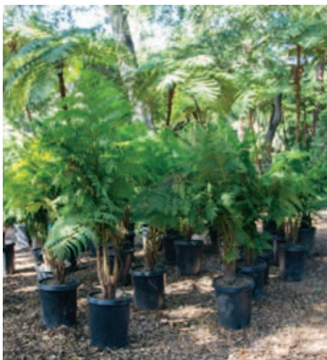
An anonymous donor provided the funds for thirty young Australian tree ferns ( Cyathea cooperi ).

As these plants grow, they will become the next generation of canopy