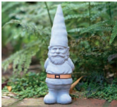
Garden Gnome. This handsome and happy Garden Gnome is the perfect addition to your magical garden. He is cast from durable AND weather-proof concrete and stands 9½" tall. $14.