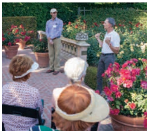
Free educational Focus Tours are open to all Garden Lover members.

As Lotusland enters into our 25th anniversary year, we want to express our appreciation to all our members—old and new—for loving Lotusland! Come and join us often in 2018.