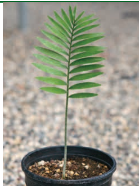
Lotusland donated an Encephalartos heenanii , a rare African cycad, to Montgomery Botanical Center.

COLLABORATIONS BETWEEN botanic gardens are crucial in aiding the survival of threatened species. In 2011, Lotusland produced seed of the rare African cycad, Encephalartos heenanii , which was the first instance of this having been successfully achieved in the United States. We then successfully germinated the seed to produce young plants. This cycad is critically endangered in the wild and some botanists believe it to be extinct in the wild. As part of Lotusland’s global collaborative efforts, we shared a number of these plants with other botanic gardens. We are also making plans to repatriate some of these rare cycads back to their native