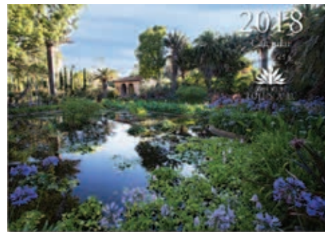
2018 Lotusland Calendar. Enjoy thirteen months of garden imagery all year long. $15.