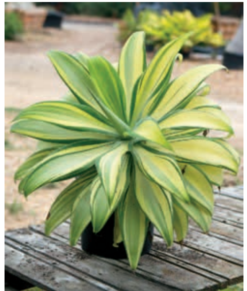
A beautiful variegated Agave attenuata will be one of the many exceptional plants at this year's event.