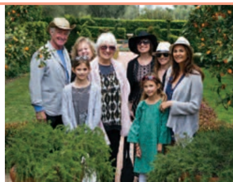
Family-level members and above may bring children or grandchildren to Lotusland.

Here are some highlights of the benefits of becoming more involved at higher levels of membership. The Family level allows you to bring your children or grandchildren (age 17 and under) when you visit the garden. Increase to the Friend level and take advantage of three one-time-use guest admissions (these are tax deductible), attend a variety of free Monday morning educational classes where our docents learn more about the fascinating history, horticulture and lore of Lotusland. Increase to any of the Garden Lover levels for exclusive opportunities! Each Garden Lover level gains varying benefits but all Garden Lovers receive advance invitations to the always sold-out Lotusland Celebrates gala plus mailed invitations to our opening receptions of art exhibitions, the free educational Focus Tour lecture and reception series and the intimate farm-to-table-style dinners that celebrate food and wine