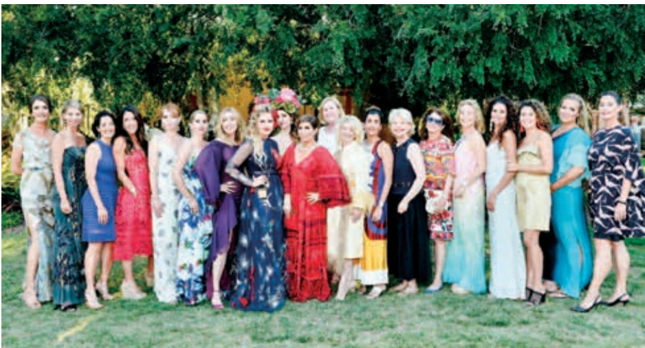
The 2017 Lotusland Celebrates: Avant Garden Event Committee.

Italian-influenced Bonna Terra cocktails were served celebrating the beauty of Lotusland with earthy arugula, strawberries and Meyer lemons. Paired with gin, this Valentino-red martini greeted guests from the moment they arrived. duo Catering and Events paired cuisine and wine, from the delectable