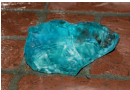
Slag Glass. Slag Glass borders many of the garden pathways at Lotusland. Each piece is unique and the approximate dimensions are 8"x6"x3". $20.