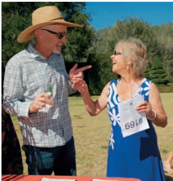
The bidding at the silent auction tables can become spirited.

Exceptional Plants: Lotusland Auction and Sale will be held on the afternoon of Saturday, October 7. Come join the fun of mingling with plant experts, enjoying delicious refreshments, engaging in some friendly bidding competition and possibly going home with an extraordinary botanical gem for your own garden.