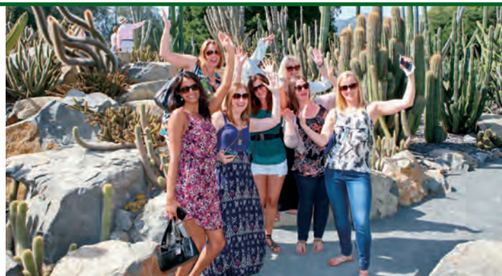
Members and friends enjoying an evening at Lotusland.

Admission is $60 for members and $70 for non-members. Reservations are required and may be made by calling 805.969.9990.