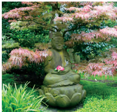
This antique Buddha statue holds a floral offering nearly every day.