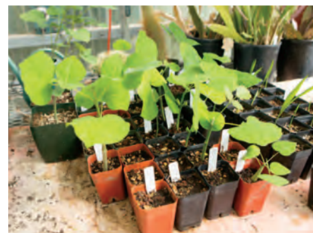
Erythrina seedlings being nurtured in the Lotusland nursery.

Species of plants that have diversified on such isolated places as islands are often quite distinct from their relatives on larger land masses. These Erythrina s represent some of those rare plants. Many are now endangered by human development, and preserving their germplasm is one of Lotusland's goals in building its plant collections. The added bonus is that they are also quite ornamental and should provide interest in the landscape when they are planted out. —Virginia Hayes