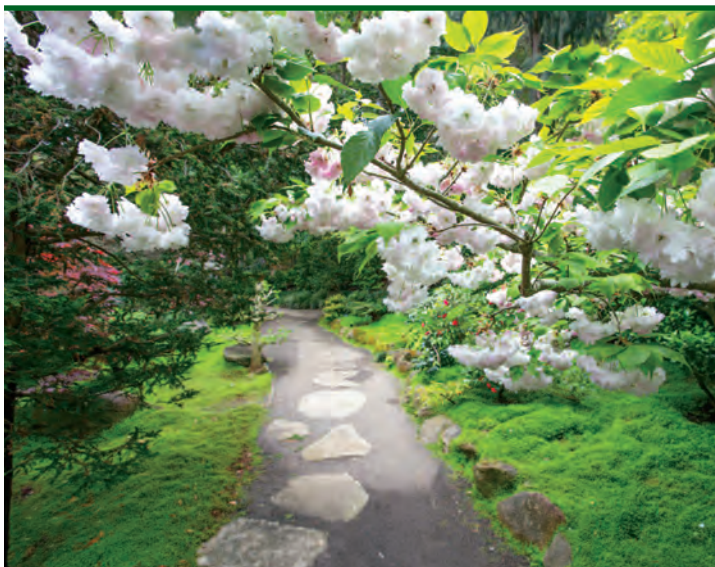
A flowering cherry tree brings spring to life along the main path.