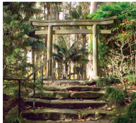
A torii gate, traditionally used to mark a place of importance, at the entrance of the Japanese garden.