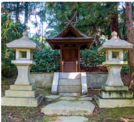
Koichi Kawana's Shinto-style shrine dates from the late 1980s.

cannot be saved, replacement of plants long lost from the garden, restoration of lost design elements, and inclusion of new design elements to meet our accessibility goals. We are pleased to have a team of two firms who are well versed in historic landscape restoration as well as Japanese garden tradition and design—Arcadia Studios, with Derrik Eichelberger as lead, and Paul Comstock Landscape, with Paul Comstock as lead, are partnering with us to fulfill this Japanese Garden Renovation Project. The team is working now to prepare a master landscape plan and a preliminary budget, which we hope to present to donors this spring. Once we have secured sufficient funding, the team will create construction documents and a final budget to launch a competitive bid process. Construction will take several months, and the Japanese garden will be closed during that time. With enough donor support, we will break ground this fall, in anticipation of opening the garden again in spring 2016.