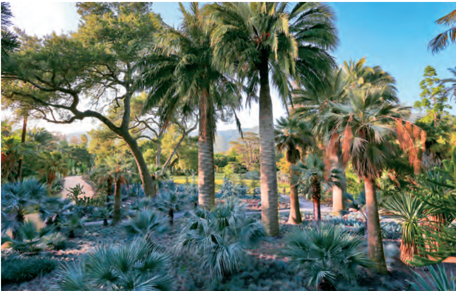
The blue garden got a new lease on color with a generous grant by the Hind Foundation.