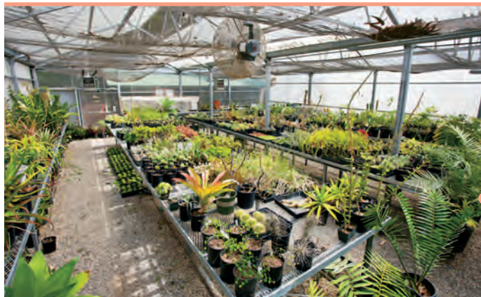
A peek inside the main greenhouse at Lotusland.

Free for Lotus Keeper members; $45 for general members. Reservations are required and may be made by calling 805.969.9990.