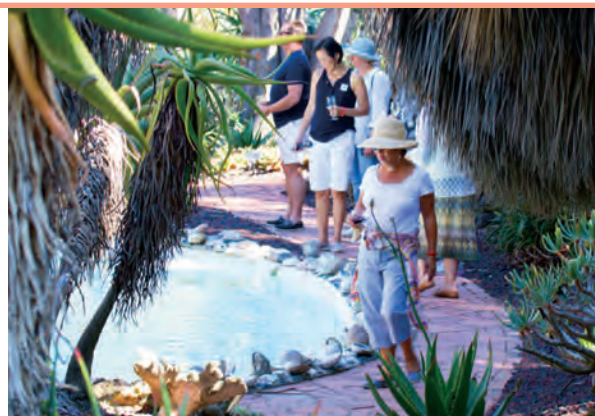
In the evening, the shell pool glows with a turquoise hue.

Begin with a cool beverage or glass of wine in a commemorative Lotusland wine glass. Journey up to the main house to enjoy a light snack and refill your glass in the sunken drawing room from 5:00 to 5:45 PM. The magical light of the season combines with the blooms and colors of the garden to create a very memorable event. Cost is $65 for members, $75 for non-members. Reservations are required. Please call 805.969.9990.