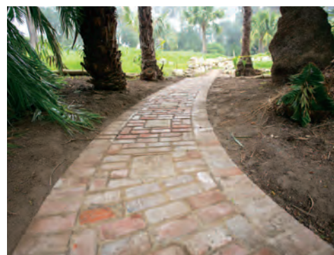
An ADA-compliant brick ramp has been installed and will provide access from the main drive to the lotus pond once the garden is opened.