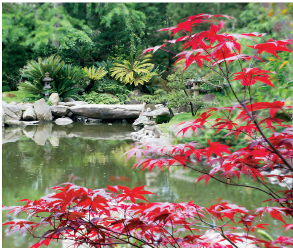
Bright new leaves of an ornamental Japanese maple frame the view in the Japanese garden.