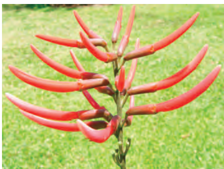
Erythrina eggersii , commonly known as Cock's-spur, is native to Puerto Rico.

M OST SOUTHERN CALIFORNIANS are familiar with the coral tree. There are several common species of this genus Erythrina including some rather large ones such as E. coralloides , which can dominate the landscape and are best suited for parks and other spacious public areas. The genus does have many other less well-known and smaller species, however. Lotusland recently partnered with the San Diego Zoo to trial some propagations of Erythrina that they are growing.