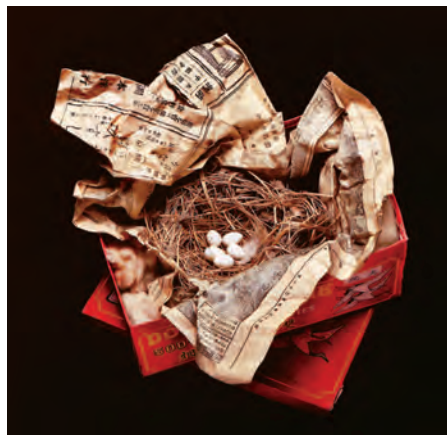
Seattle artist Sharon Beals Barn Swallow Nest Photograph