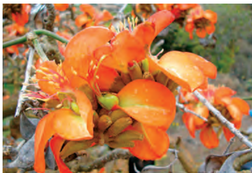
Erythrina sandwicensis from the Hawaiian Islands.

Erythrina s grow on the major continents of the world with subtropical or tropical climate zones, as well as islands that may have once been connected to them. One of our new accessions is a form of E. breviflora named petraea . It is native to Mexico, but in a very restricted region. Others received in this exchange are E. eggersii from the Virgin Islands and Puerto Rico, E. elenae native to Cuba and E. sandwicensis , which hails from the "Sandwich Islands" as the early maritime explorer Captain Cook called the Hawaiian Islands.