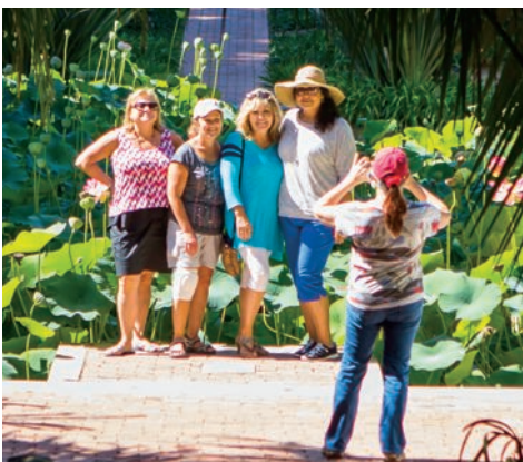
The water garden was full of lotus flowers and provided yet another perfect Lotusland photo op.