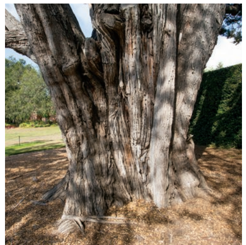
The massive trunk is hollow and many of the branches are cracked and dying.

Lotusland's Monterey cypress is the stately sentinel on our great lawn and losing it will be the ending of an era, so it is our intent to replace it. In fact, we have attempted to propagate the tree for years, hoping to replace this regal