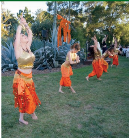
A surprise Bollywood Flash Mob descended on the astonished guests during dinner.