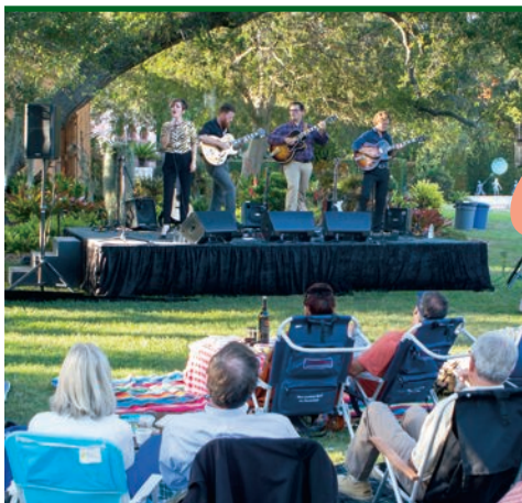
The afternoon light filtering through the upper bromeliad garden provided a brilliant light show for a truly superb performance.