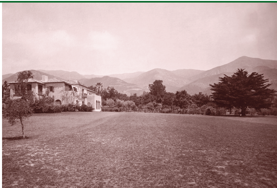
Photograph from the 1920s showing the Monterey cypress on the great lawn prior to the addition of the pavilion.