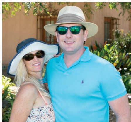
Making LotusFest! a traditional outing helps build a connection to both each other and the garden.