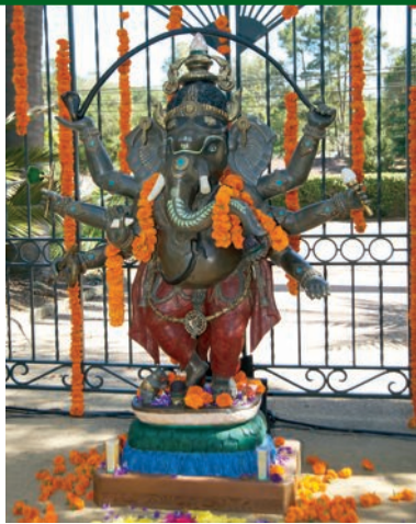
The Lotus Ganesha, on loan from JadeNow Gallery, was a favorite photo op.