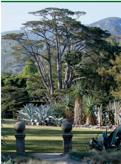
This beautiful tree dominates the landscape from many viewpoints, including this view from the blue garden.