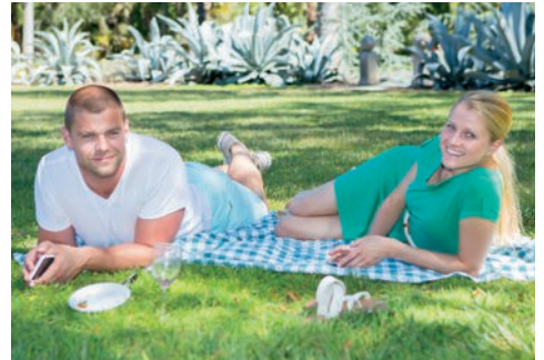
LotusFest! affords visitors a rare opportunity to enjoy a very casual and leisurely afternoon on the great lawn.