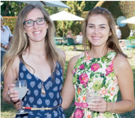
A beautiful summer day sharing Lotusland with a friend makes this celebration a memorable occasion.