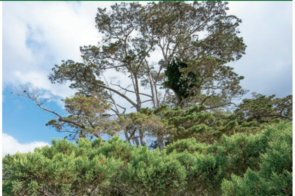
While the upper canopy is thinning, the lower branches are full of green leaves and can continue to photosynthesize.