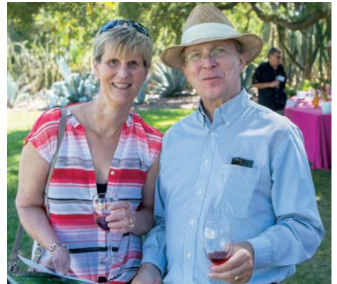
An afternoon of wine tasting at Lotusland creates a different way to experience the garden.