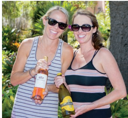
Brander Vineyard poured delicious selections that were very well received by all those at the event.