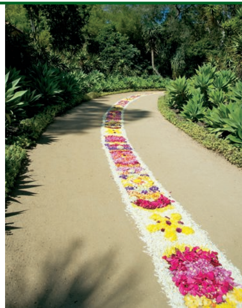
The amazing flower petal mosaic was the beginning of the pathway to the party.

Following the live auction, guests were honored to hear from Lotusland's