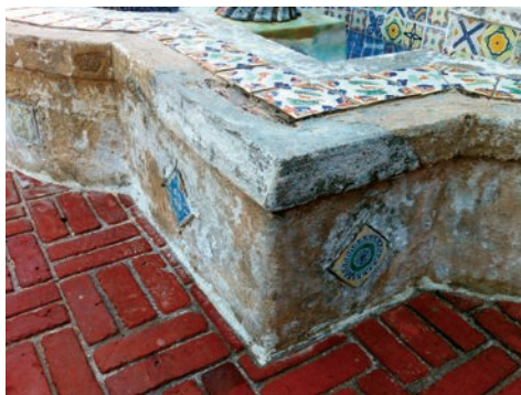
The Neptune fountain before the renovation...

BEFORE A RENOVATION of the basin and installation of a re-circulating pump in 1996, potted plants were displayed in the Neptune fountain because the basin could not hold water. Recently, regular maintenance of the Neptune fountain revealed leaks saturating and deteriorating the cement structure of the fountain. Lotusland's maintenance staff worked with DaRos Masonry to dry out the fountain walls, scrape away the loose material and clean the fountain's tiles. The surface was then prepared for a new finish coat of plaster and color coat. As part of the restoration project, the statue of Neptune was removed for cleaning, and a soft water spigot was installed to help reduce the build-up of mineral deposits on the fountain's surfaces.