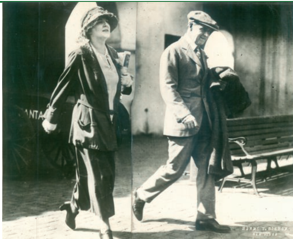
Now you see them and now you don't! Here is where a Daily News photographer caught up with the elusive Harold F. McCormicks as the former Ganna Walska and the harvester magnate left for California following their remarriage in Lake Forest Feb. 13. Wed first in Paris, they were united in a second ceremony to conform to the laws of Illinois.

We preserve and enhance the unique, historic estate of Madame Ganna Walska, care for and improve its collections, and develop its conservation and horticulture programs, so they educate us, inspire us, and advance our understanding and appreciation of the importance of plants in our lives and in the life of the planet.