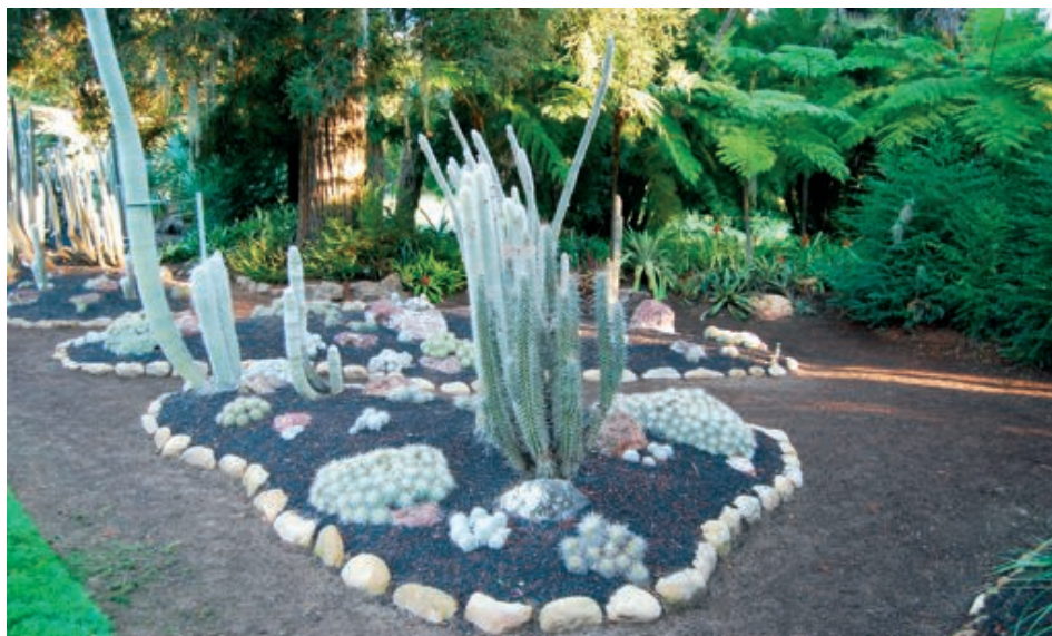
Take a look at the renovated "miniatures" the next time you visit Lotusland.

and may have been planted there in the 1970s. Recently, Lotusland's bromeliad gardener, Mike Furner, initiated a project to renovate the "miniatures." A few plants were removed and others were selectively trimmed and cleaned up before sand and compost were worked into the soil by hand. A top dressing of 3/8" black lava rock was added and cleaning the pathways and bordering bromeliad and Doryanthes palmeri beds completed the renovation.