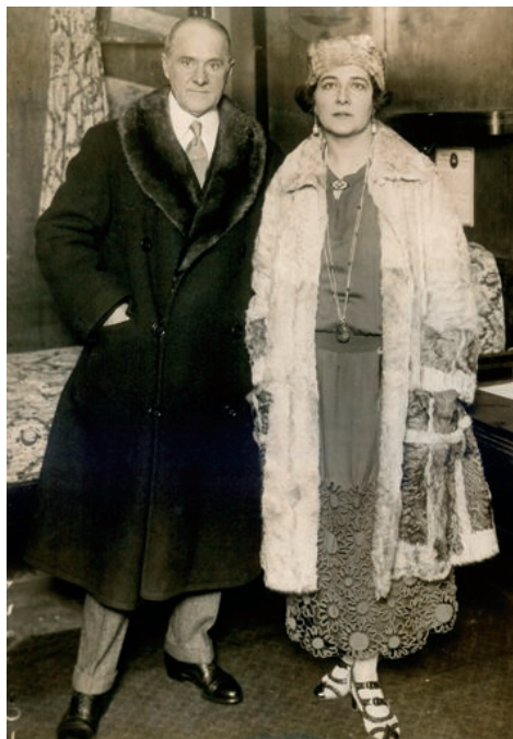
Ganna Walska off to conquer Paris alone when Harold F. McCormick leaves ship suddenly. The above photo shows Harold F. McCormick and his temperamental wife, Ganna Walska, as they appeared aboard the liner Paris Saturday morning just before it sailed. A few minutes after the above photo was taken Mr. McCormick was seen to rush down the gangplank, leaving Ganna to sail alone for Paris, where she will again attempt to win the favor of music critics with a performance of Madame Butterfly in the Champs Elysees Theater, which her husband bought for her. Their sudden parting was a surprise to all. [dated Jan. 18, 1926]