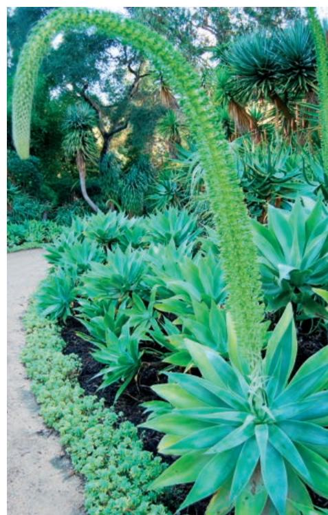
Screened Lotusland compost was added to the soil by grounds staff as they thinned and replanted agaves along the main drive.

BEGINNING JUST INSIDE the Sycamore Canyon Road gate, the main drive is bordered by sedum, Agave attenuata , aloes and dracaenas almost all the way to the Japanese garden's torii gate. It's another iconic Lotusland landscape with the agaves seemingly turned toward the gate welcoming visitors as they begin their tour of the garden. The origins of this landscape are sketchy. Ralph Stevens designed the Sycamore Canyon gate when he worked at Lotusland in the 1950s, and it is most likely that he designed the entry landscape as well. Charles Glass supervised a renovation of the area in 1975-76 that included widening the driveway and replanting the agaves on a raised berm...a nice design feature as well as improving the growing conditions. Recently, Lotusland's grounds superintendent, Esau Ramirez, directed a renovation of the area that included culling the agaves and removing selected background aloes, dracaenas and yuccas infringing on the agave berm. Many nice Aloe salm-dyckiana cuttings and hundreds of A. attenuata pups were salvaged during the renovation. —Michael Iven