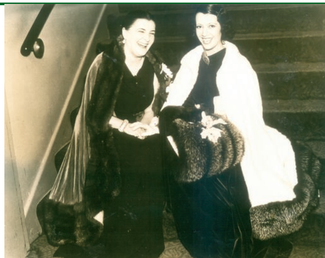
Ganna Walska, the prima donna, finds something very funny as she sits beside Lily Pons in the Radio City Music Hall at the world premiere of Miss Pons' first RKO Radio picture, "I Dream Too Much."