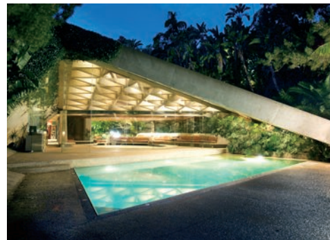
Exterior of the Sheats Goldstein residence.

PLEASE NOTE: As this is a private residence, there is no disabled access to the many outside stairways. Comfortable walking shoes are a must.