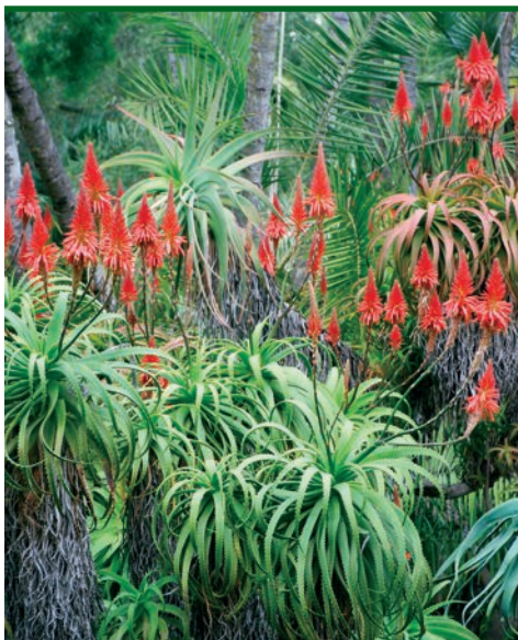
Aloe pluridens is common in its native range in the coastal region of eastern South Africa.

so its use as a burn treatment (including sunburn) is valid. The most commonly cultivated species for commercial products is known as aloe vera ( Aloe barbadensis ), although A. ferox and A. africana are also grown commercially.