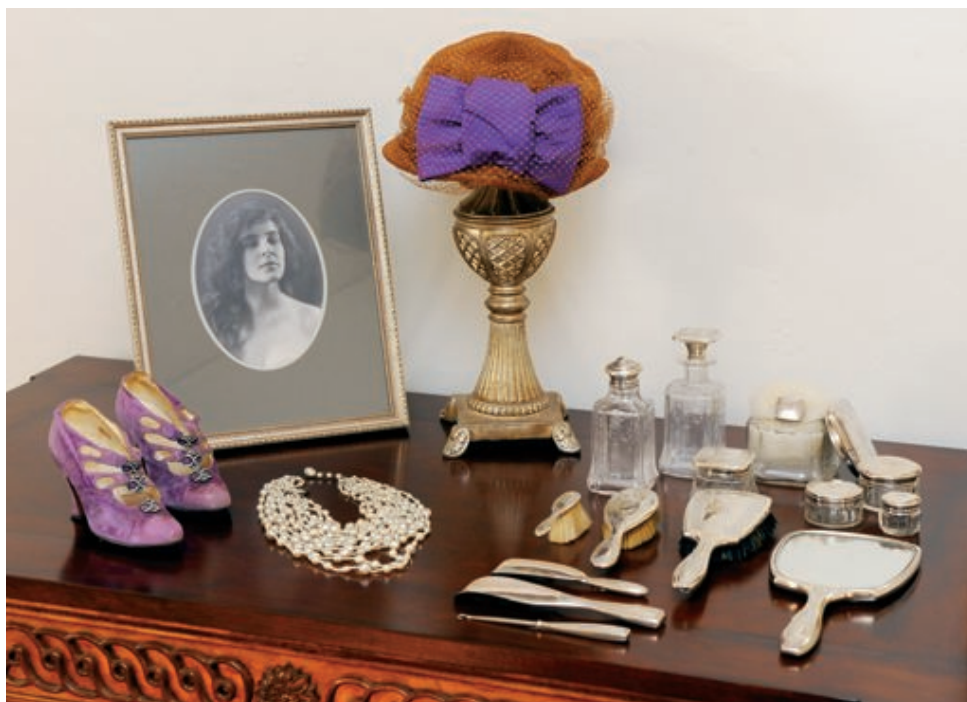
The exhibit will feature an eclectic mix of Madame Walska's personal possessions.

Members may view the exhibit at no charge when scheduling a self-guided tour or docent-guided tour. The cost for nonmembers is adults, $35; ages 5 through 18, $10; 4 years and under, free. Reservations are required and may be made by calling 805.969.9990 or by emailing reservation@lotusland.org .