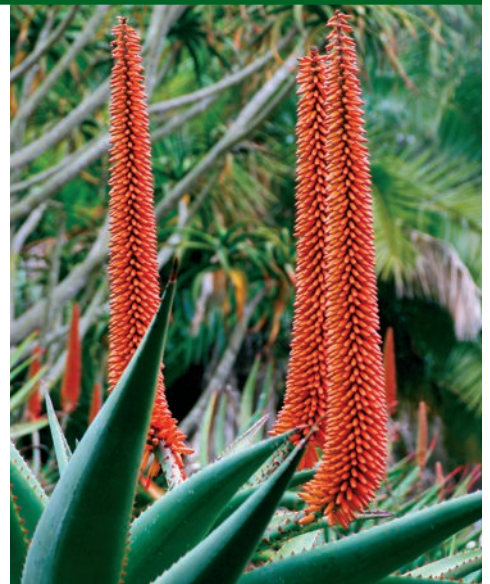
The flower stalk of Aloe marlothii is notable for its unique wide-spreading branch structure,

It is the aloe flowers, of course, that set them apart in the plant kingdom. They are tubular and are displayed on simple or branched stalks. Hundreds may be crowded together in the larger species or merely a dozen or so in the smallest ones. Colors of individual blossoms range from the palest of oranges through yellows and deep brick red. Many inflorescences display more than one color at once as unopened buds, open flowers and spent ones progress through two or three shades during their lifespans. The stately Aloe speciosa carries large unbranched flower spikes of coral pink buds at the apex, shading to palest greenish white at the bottom. Added to the color display are the bright yellow-tipped orange stamens that extend beyond the pale petals of the opening flowers. There may be two color forms within a species. Both yellow and