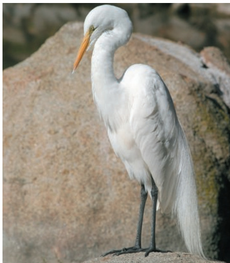
LARRY JON FRIESEN, SATURDAYS.NET

We will have several pairs of binoculars to lend if you don't have your own. The cost is $25 for members and $35 for nonmembers. To register, please call 805.969.9990 or email reservation@lotusland.org .