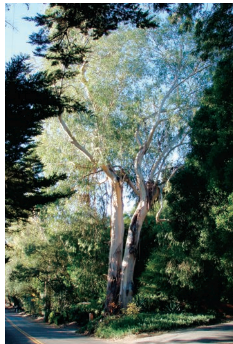
E. camaldulensis at Ashley Road staff entrance.