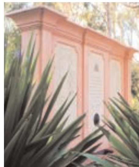
All visitors walk by the Wall of Honor as they enter Lotusland.