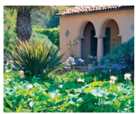
It was a perfect day for LotusFest guests to see the lotuses in full bloom in the Japanese and water gardens.