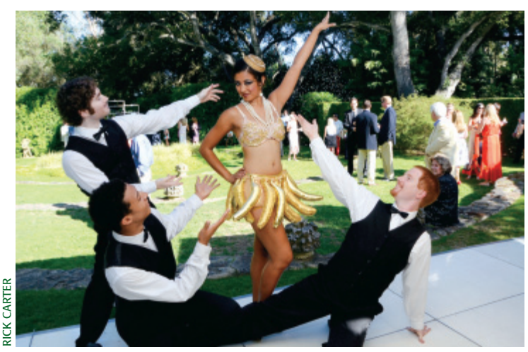
State Street Ballet provided marvelous dancers including an amazing Josephine Baker impersonator.