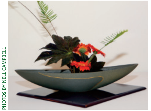
A demonstration and display of Ikebana, the art of Japanese flower arranging, is a popular part of our annual LotusFest.