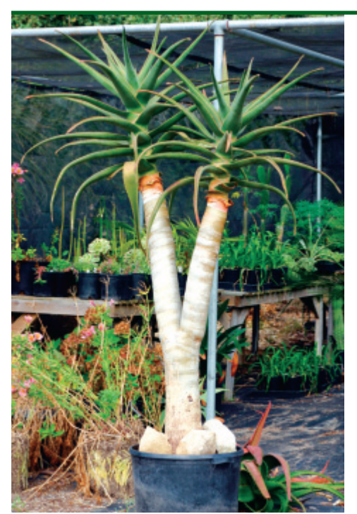
Aloe 'Hercules' is truly herculean. It is the offspring of two tree aloes: Aloe barberae and Aloe dichotoma.

Calibanus that was planted by Glass was apparently close enough to a male Beaucarnea to achieve a fertile union. Seed collected from the Calibanus was sown, and the resulting seedlings showed abnormalities that suggested they were not the pure species. A few of the resulting plants were planted in the cycad garden and grew there for more than 25 years. They have greater base diameters than any Beaucarnea, but also formed short trunks and multiple branches. As the cycad collection grew, Lotusland staff relocated some of these interesting hybrids to make room for expansion of the cycad collection, and one of them was potted for sale at the recent auction. It garnered a winning bid of $6,000.