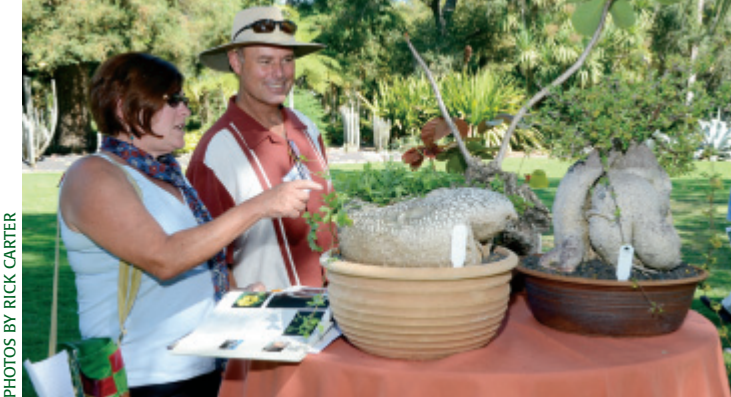
Plants in many plant families form swollen stems called caudicies. These two, Ibervillea sonorae and Fockea edulis, were sought after in the live auction.