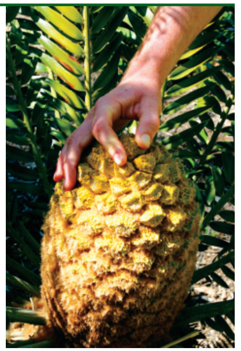
When the female cone of Encephalartos heenanii was fertile, pollen was introduced through small openings between the cone scales.

After spirited bidding, one lucky live auction bidder won the privilege, for $1,000, to grow this exceedingly rare plant in his collection. The remaining plants will be held for future planting, propagation and distribution to other botanical institutions, helping to further ensure the continuing existence of this species.