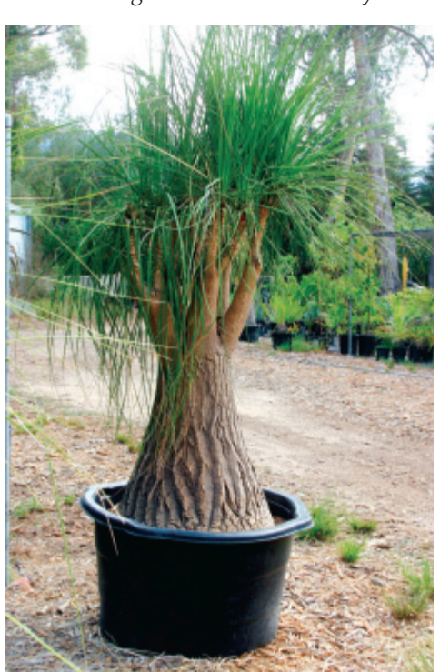
Weird and wonderful, this hybrid shows characteristics of each of its parents: Calibanus hookeri and Beaucarnea recurvata.

Growing on steep cliffs in the mountainous grasslands of the border region of South Africa and Swaziland is a cycad with a tenuous hold on survival —Encephalartos heenanii. This cycad has a very limited distribution, and habitat degradation and over-collecting have taken a toll on this species. It may now be more numerous in gardens than in the wild. Plants such as Encephalartos heenanii find refuge at Lotusland, which acts as an insurance policy against extinction. At the end of 2010, to the excitement of Lotusland staff, a female E. heenanii developed a cone. Pollen of the same species was acquired from Loran Whitelock (cycad collector and source of many of Madame Walska's original cycads), and the cone was pollinated multiple times in early March 2011. The seed was harvested and cleaned on September 16, 2011. According to Whitelock, this is the first time seed of this species of cycad has been produced in the United States. Seeds were sown on January 27, 2012 and the first germinated on February 20.