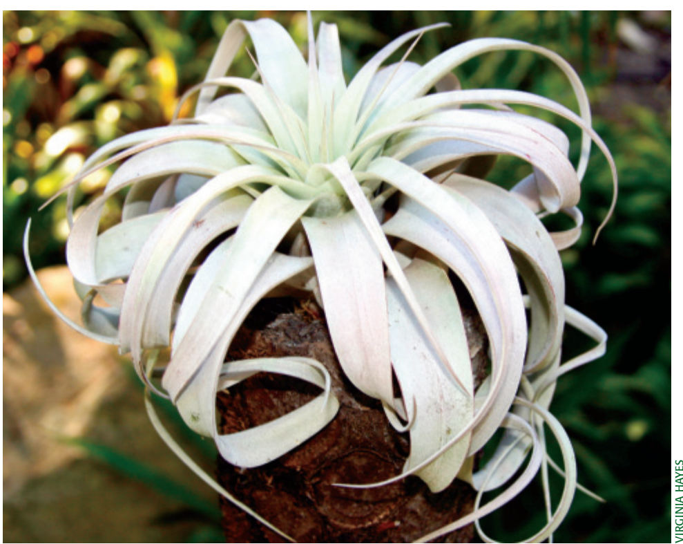
Tillandsia xerographica grows epiphytically on the highest branches of trees in the dry forest regions of Mexico, El Salvador, Guatemala and Honduras.

Because of its beautiful shape and size, this air plant (often called the King of air plants) has long been sought after and collected from its native habitats in Mexico. Guatemala and El Salvador. and is now protected by listing on Appendix II of the Convention on International Trade of Endangered Species. Plants take from 12 to 18 years to mature and flower. Nursery production of the plants is possible, but the species is slow-growing and, like many other bromeliads, the mother plant dies once it flowers, producing one to three offshoots that can be harvested and grown. Lotusland's plant