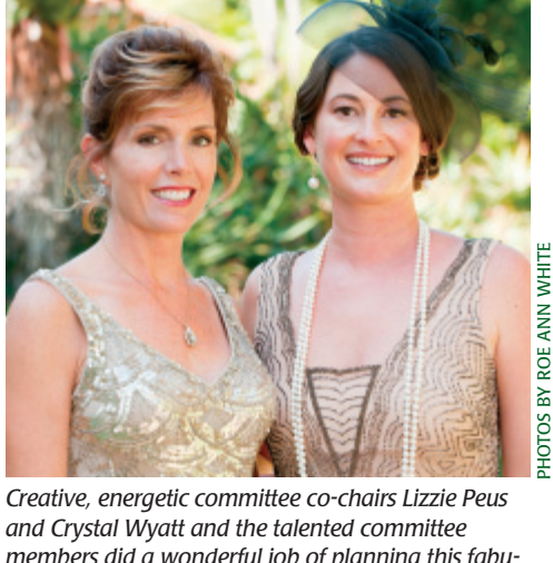
members did a wonderful job of planning this fabulous event, the most successful in Lotusland's history!

Then, imagine the guests' surprise as they entered the main lawn and encountered the 30-foot-high Eiffel Tower! No Parisian party would be complete without an arrogant—but