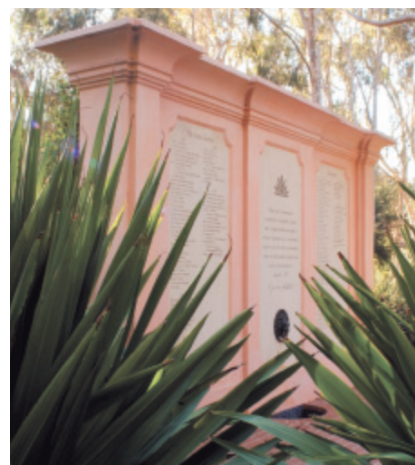
All visitors walk by The Wall of Honor as they enter Lotusland.