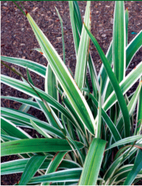
The iris-like leaves of this variegated selection Dianella tasmanica are edged in white.

WHAT DO YOU PLANT in a long, narrow planting bed bordered on one side by a roadway and on the other by a pedestrian path? This difficult scenario occurs more often than many gardeners would like, and Lotusland has one such area in a very prominent place: right in front of our visitor center. After trying various shrubs and groundcovers, we think we have finally hit on a winner. Basing our choice on our experience with the all-green form of Dianella tasmanica , which is fast growing and very durable, we have planted a variegated form that has bold white stripes on its leaves.