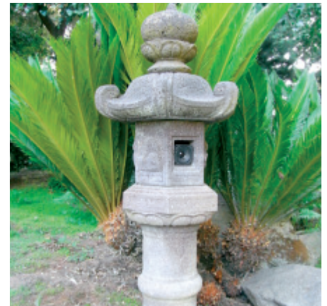
Kirsten Reese planted sounds throughout the garden, like audible flowers. A lantern in the Japanese garden is one of many sites.

The installation will be part of our regular docent-guided tours or you may choose to walk in the gardens at your own pace. Those visiting on the afternoon of Saturday, March 20 are invited to a reception at 3:15 PM. Kirsten Reese will give a short talk and be available to answer questions. Reservations are required. Please call 805.969.9990 or email reservation@lotusland.org .