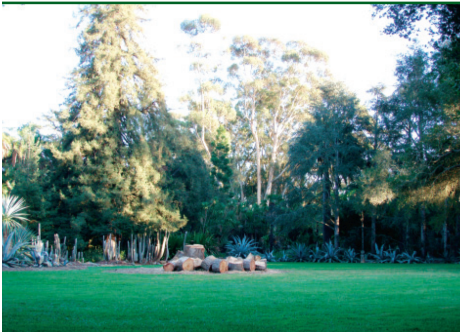
Once the limbs and trunk were cut up and hauled away, all that remained of our majestic oak were the remnants of the stout trunk.

looking for opportunities to maintain the tree canopy through introduction of young specimens, retain intimate garden spaces through renovation of mature