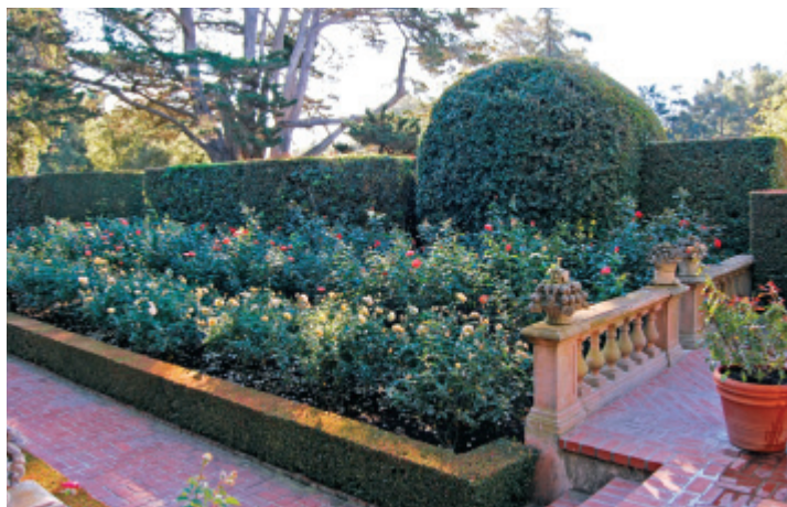
The section of hedge to the left of the arch will be replanted to match the short section to the right of the arch.

Although eugenia grows quickly, the parterre hedge renovation will be noticeable throughout the 2010 tour season as the new plantings mature. You will be able to monitor the progress on visits to the garden in 2010. —Michael Iven