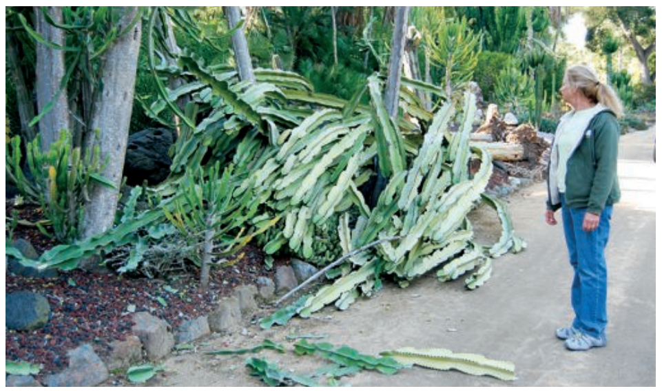
During a winter storm, large euphorbias blew over and revealed roots that were infected with armillaria (oak root fungus).

A hard-to-find leak in the reservoir supply line became the biggest mystery of the year. Video cameras sent up and down the pipe and some intuitive