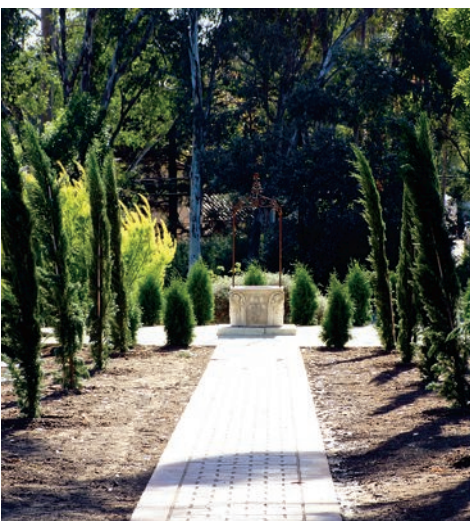
Italian cypresses flank the brick path and 'Rushmore' arborvitae will enclose the wishing well.

N DECIDING WHAT PLANTS to use in recreating the long brick walk and renovating the water stairs, it was important to replicate the original look and feel of the space. It is clear from the old photographs that Italian cypresses flanked the brick walk with a ground cover of ivy below. Italian cypress ( Cupressus sempervirens ), in spite of its common name, is not native to Italy, but rather to several other eastern Mediterranean countries including Crete, Greece and Turkey. In their native