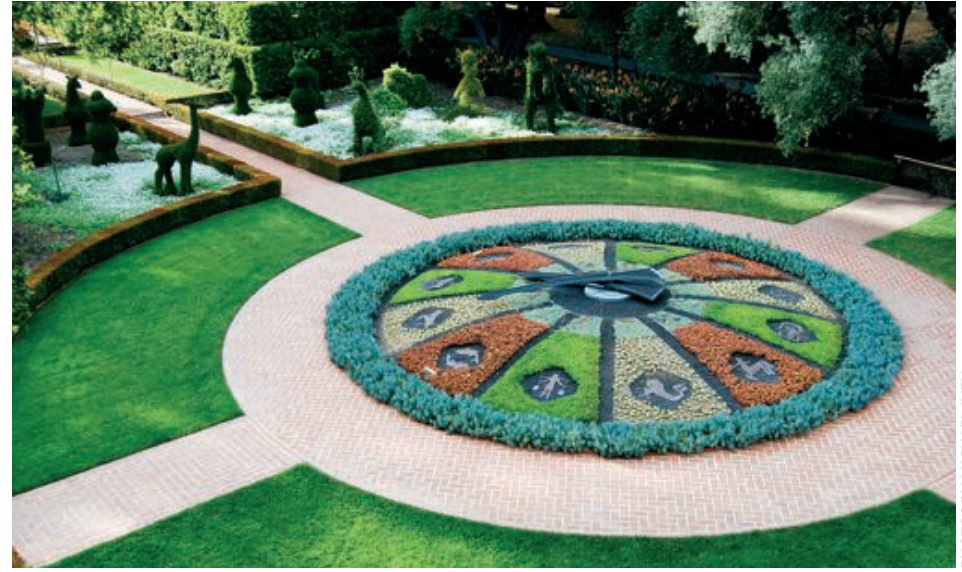
Lotusland's many exquisite features, including this horticultural clock, bring to mind a quote from Thomas Cooper. "A garden is never so good as it will be next year."

Conditions related to the 2007 Japanese pond silt removal project continued into 2008 as staff and consultants worked to implement a system favorable to the restoration of an ecological