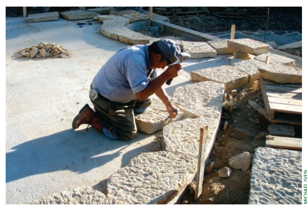
A sandstone viewing platform and gathering place was constructed around the wishing well at the top of the water stairs.

head have now been refurbished and are accessible again. Stone paving has been added around the wishing well to provide a stable surface for visitors. Water circulates from the wishing well to the water stairs where it spills over the lips of the stepped basins. The construction project also included replicating the original allée and hedges. While the cypress allée has much the same look and feel that it had when Mrs. Gavit commissioned it, some compromises had to be made. On the