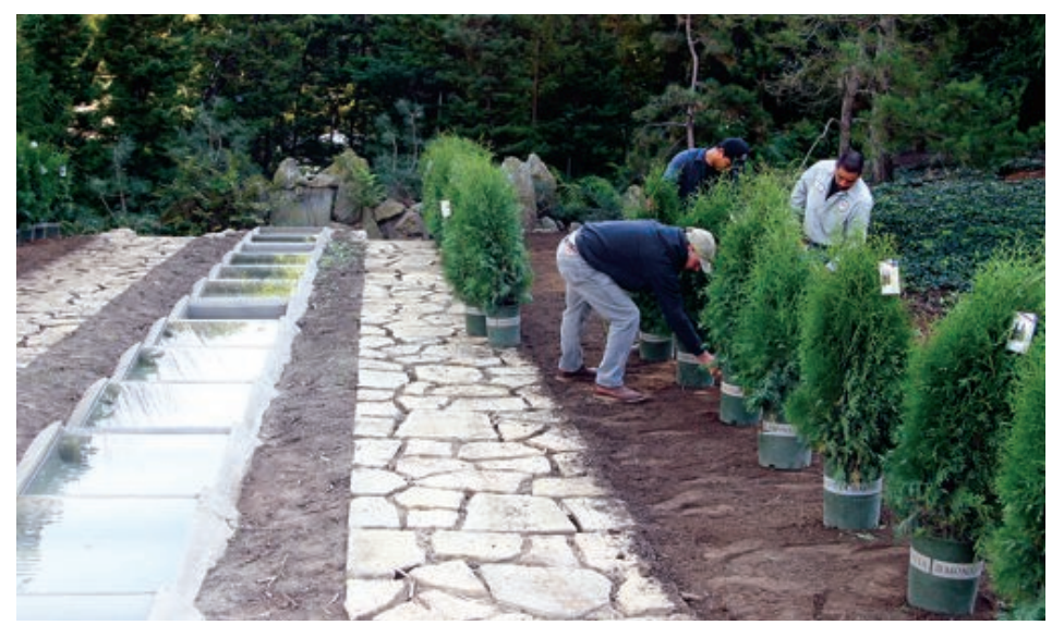
Exact placement of the arborvitae will ensure their growth into a uniform hedge.

habitat, trees can reach more than 100 feet in height and have been known to live for 1,000 years or more. In garden situations, they rarely achieve either of these extremes. They grow as narrow columns, only three or four feet in width and perhaps 50 feet in height, although they can be topped to maintain a lower profile.