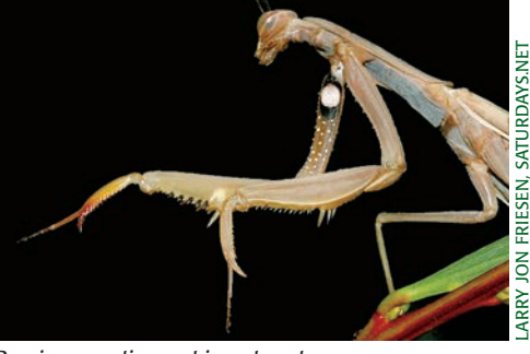
Praying mantises eat insect pests.

For more information or to make a reservation, please call 805.969.9990.