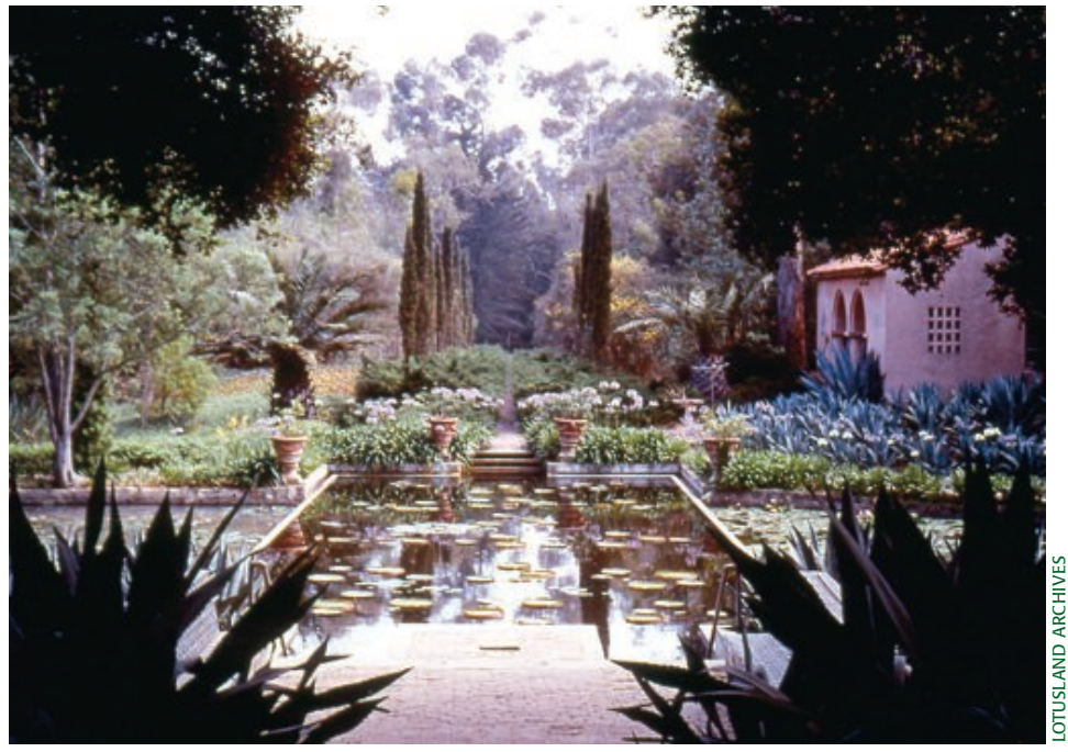
This photograph, presumably taken in the late 1940s or early 1950s, shows the Gavit swimming pool, which is now home to exotic water lilies, and the cypresses still flanking the allée.

Photographs of this formal garden feature, published in Winifred Starr Dobyns' California Gardens (1931), show an allée of Italian cypress flanking the long walkway with a groundcover of ivy. The wishing well was surrounded by a dense evergreen hedge that subsequently also enclosed the flagstone paths on either side of the water stairs. This type of formality was typical of Continued on page 2