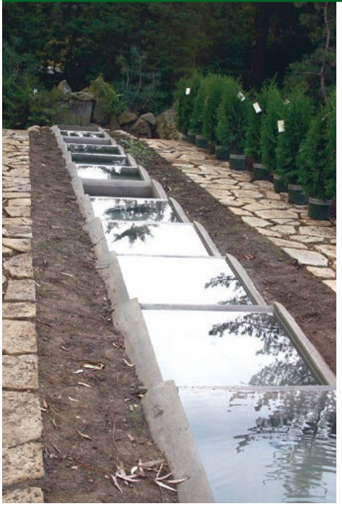
When the plumbing and electrical work is finished on the water stairs, a final planting of the ivy ground cover will complete the project.

east side of the allée, Madame Walska planted an arboretum of exotic trees in the 1950s, and on the west side, the visitor entrance was constructed in the early 1990s. These plantings may be glimpsed between the procession of cypresses. The stone waterfall and