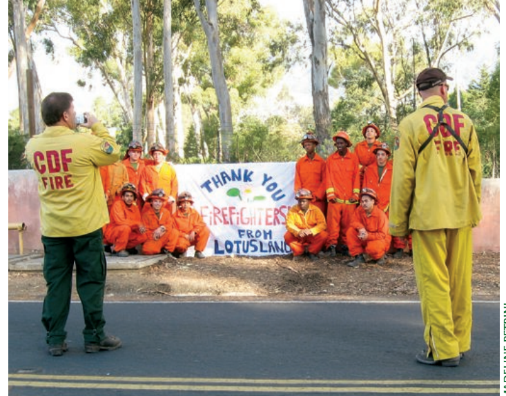
We are extremely grateful to all of the firefighters who protected Lotusland from the devastating Tea Fire that raged so near to us and destroyed the homes of several of our members and volunteers. Local firefighters pose in front of a banner that Lotusland staff members created and hung on the "pink wall" bordering Sycamore Canyon Road.

The bus will depart Lotusland at 9:15 and return by 4:00. Please plan to arrive at 9:00 to facilitate this early departure. The fee of $100 for Lotusland members and $110 for nonmembers covers transportation, admission and a delicious buffet lunch. Space is very limited, and this popular tour fills up quickly. Please use the coupon on page 15 to reserve your space.