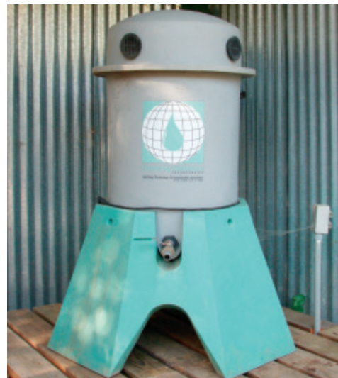
A 100- or 25-gallon tea brewer produces an extract of compost containing nutrients and a multitude of bacteria, fungi, protozoa and nematodes.

Mechanical (pulling and hoeing) and cultural methods are employed to con-