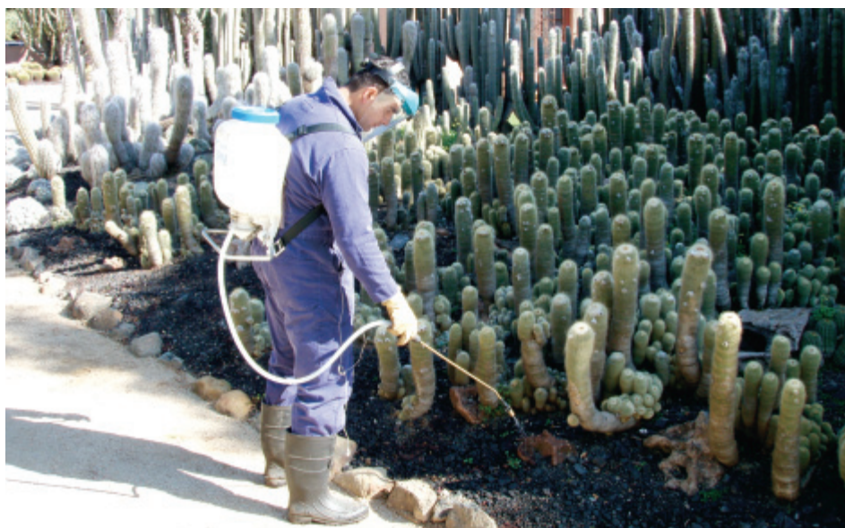
A 20% acetic acid solution is effective on young weeds growing through the ornamental lava rock.