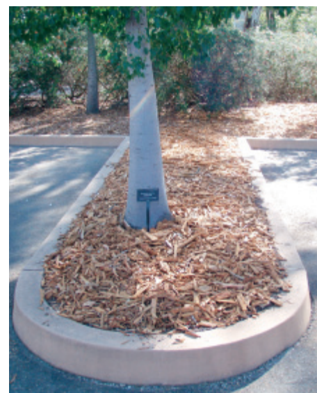
Wood chips keep weeds at bay and improve soil conditions as the chips decompose.