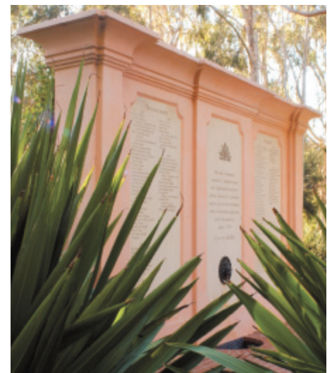
All visitors walk by The Wall of Honor as they enter Lotusland.