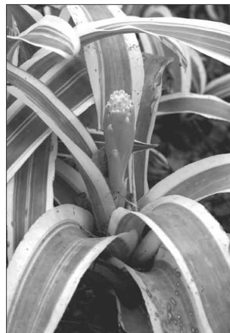
Billbergia pyramidalis 'Kyoto' is a variegated selection with a strawberry pin inflorescence.

A number of bromeliads look more like a yucca or other succulent plants.