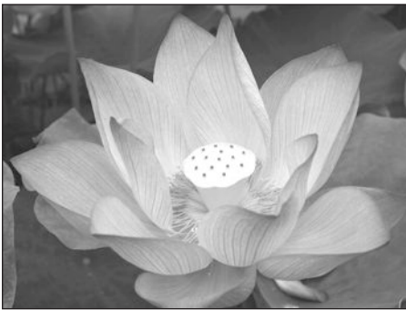
One of the many Chinese lotus cultivars, this Qingdao selection has delicate pink petals with rosy red tips.