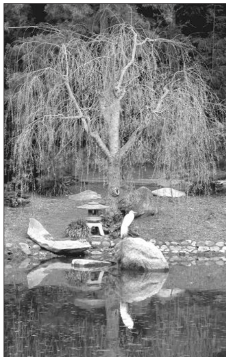
Weeping willows in the Japanese garden are among the deciduous trees that receive regular pruning to maintain their shape and proportion.

The annual trimming of large, deciduous trees in the Japanese garden was completed by Arbor Services with consultation by Lotusland staff and Brett Warner. Brett has worked as a contract arborist at Lotusland for many years and is particularly familiar with the aesthetic style and culture