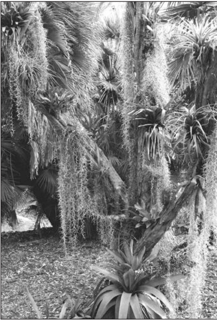
A dead citrus tree became the stage for a number of epiphytic bromeliads.

loose pyramid. Each short branch will carry several flowers that open in succession over a long period of time. Stunning in flower, P. alpestris has