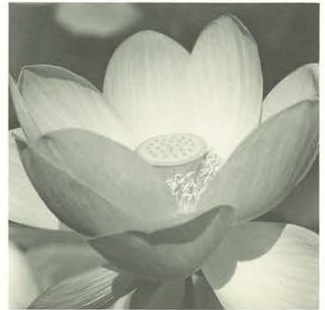
Lotusland's namesake in a radiant photograph.

Three other kinds of waterlilies are grown at Lotusland. Spatterdock or cow lily ( Nuphar luteum subsp. polysepalum ), a large-leaved, prickly waterlily from Asia ( Euryale ferox ), and the wondrous Victoria from South America. By far the most spectacular, Victoria dominates the waterscape. Its leaves may reach diameters of six to eight feet in their native habitat, and can exceed four feet across even in our less tropical cli-