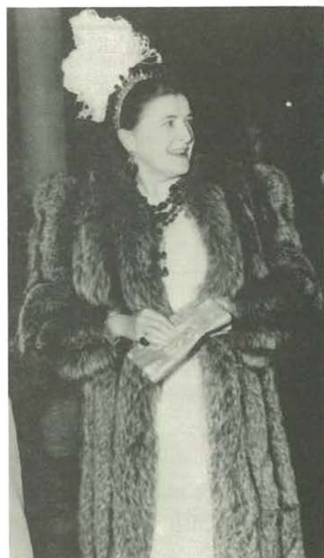
ABOVE: Ganna Walska caused a sensation when she arrived at the Metropolitan Opera House on opening night 1945 in a "bare midriff gown, trimmed with beaded spangles."