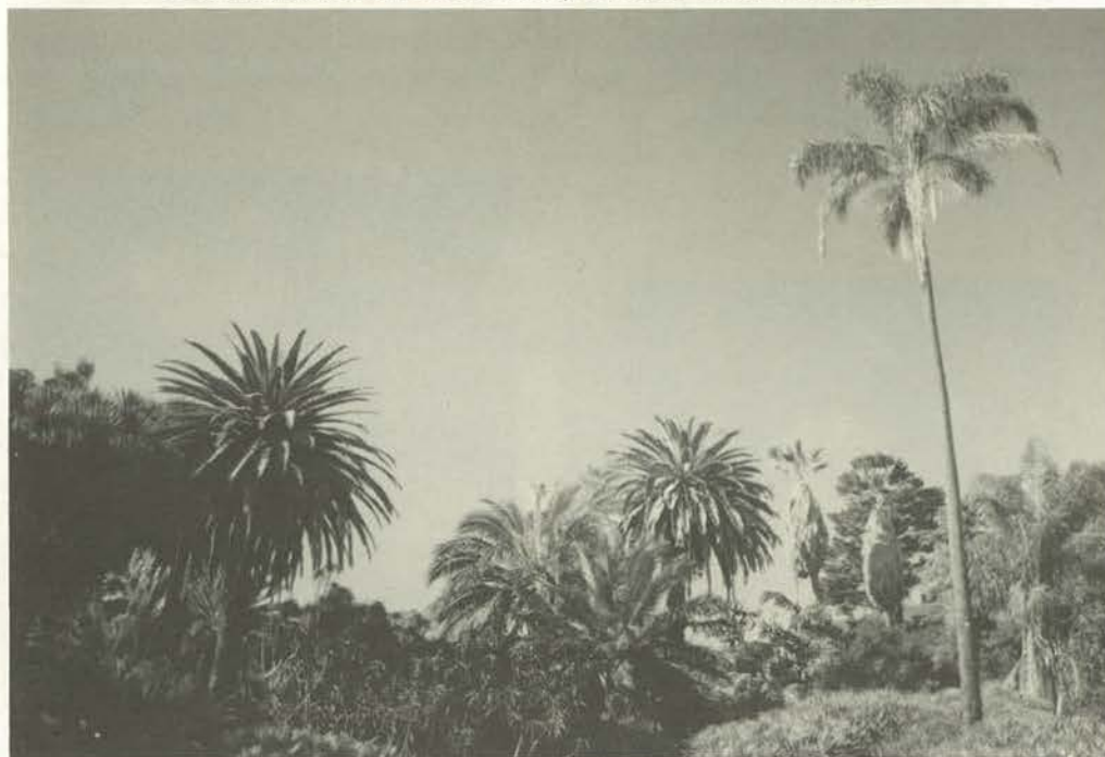
Palm vista from main residence courtyard.